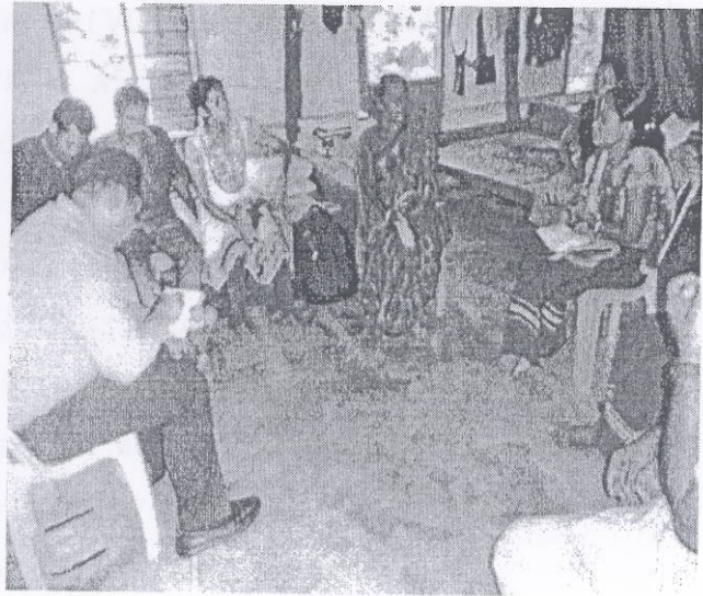
TUISANAI MUTOH SHG & PINE SHG

2) Pine SHG - The group formed SHG has been listed as 'B' grading and the SHG member has already been given. The SHG has been provided following fund of Rs. 10,000/- and the Contract has been signed. Fund (L1) amount of Rs. 20,000/- only. The SHG is engaged in planting of pine saplings, the contract has been signed. However, amount of income to be received from the SHG. The SHG has been directed to ensure that the amount is used for the purpose.